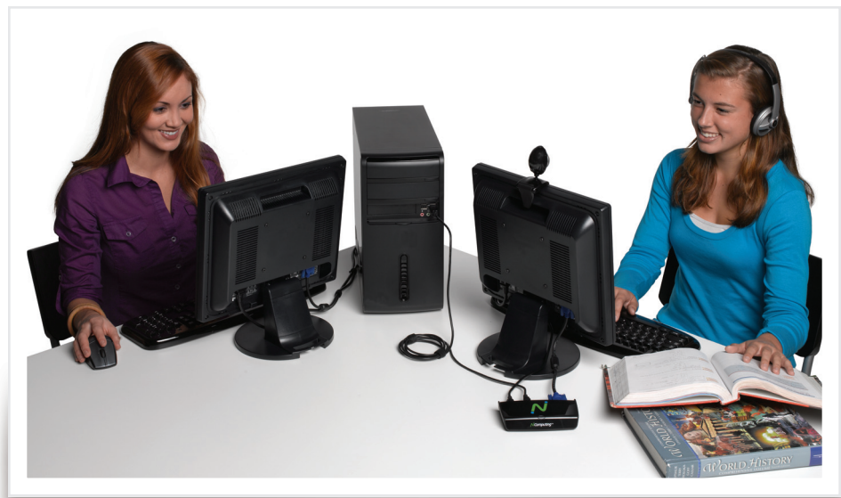
The U170 is ideal for classrooms, public access, small business, digital signage, and home use.

Desktop virtualization does not have to be complex. Or expensive. Unlike other desktop virtualization solutions, NComputing does not need expensive and complicated servers and infrastructure. In fact, vSpace was designed to efficiently share the normally wasted CPU cycles in standard low-cost PCs. In an NComputing solution, vSpace creates multiple virtual workspaces in one physical computer, and then the additional users connect their monitors, keyboards, and mice, through a simple access device. With the U170, connecting the access device to the shared computer couldn't be easier: just snap them together with the included USB cable.